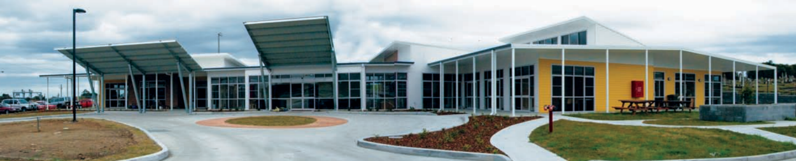
Above: The Mai-Wel Community Centre